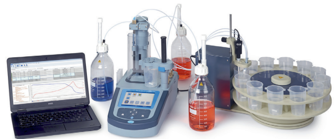
System setup illustration with AT1000 Series Titrator and AS1000 Sample Changer

AS1000 Sample Changer multi-parameter automation solutions release operators' time from cumbersome repetitive analyses for more valuable tasks that cannot be automated.